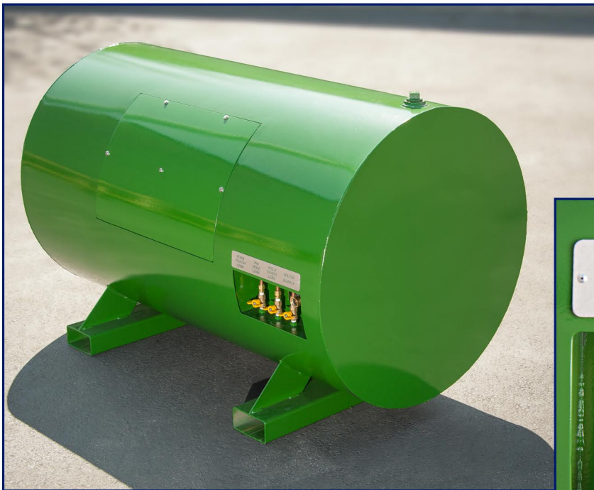
Bulk Storage Tank Hazmat Training Prop

This prop meets California Title 19, Section 2560-G Field Training Facility requirements.